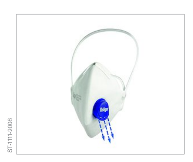
Breathe easier with the CoolMAX<sup>TM</sup> exhalation valve