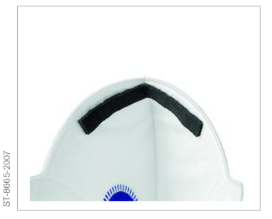
Nose pad for safe sealing around the