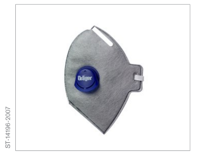
Activated carbon layer against nuisance odours