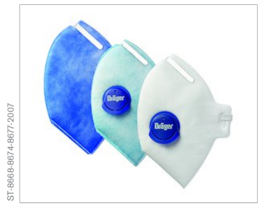
Color coding for fast recognition of protection classes